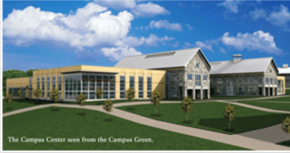
The Campus Center seen from the Campus Green.

1,000 students, but it's only built for 600. "We can't even get the whole upper school in the theater," says Ham Clark, Episcopal Academy's Head of School. "We're feeling really cramped."