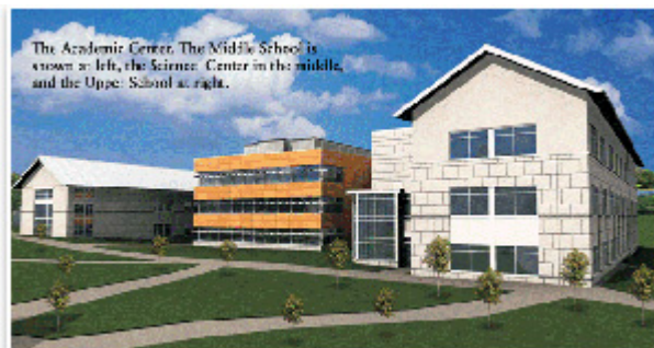
The Academic Center. The Middle School is shown to left, the Science Center in the middle, and the Upper School to right.

All four firms coordinated the materials used as well as the landscape layout of the campus, with its pastoral central