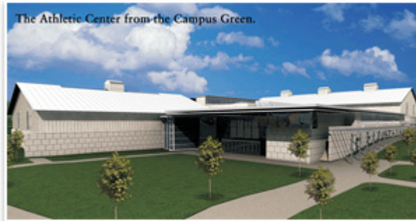
The Athletic Center from the Campus Green.