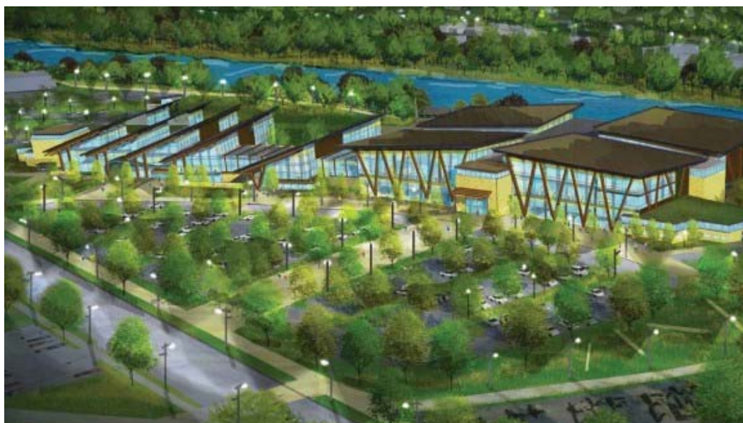
The Sonnentag Event and Recreation Complex renderings, as seen from Menomonie Street.